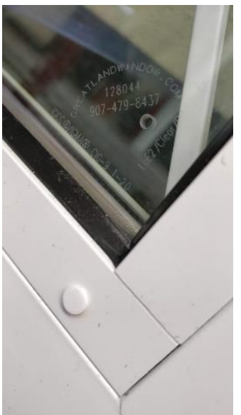
Type 1a – Great Land Window